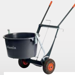
Additional accessory: Transport trolley