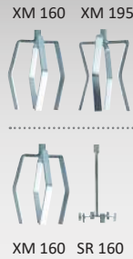
Tool set 1*